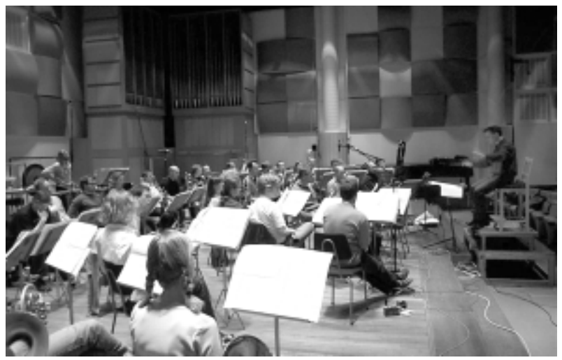
THE STOCKHOLM WIND SYMPHONY DURING THE RECORDING SESSION

rapidly grew into a complete band. From the year 2000, the Stockholm Wind Symphony has operated under the aegis of the Stockholm County Council. The orchestra is Stockholm's only and Sweden's largest non-military professional symphonic wind orchestra, with 45 musicians.