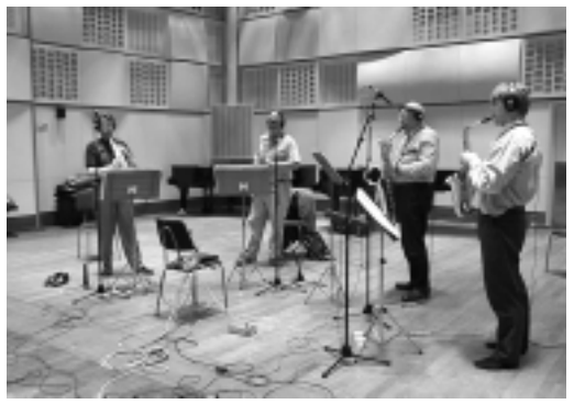
STOCKHOLM SAXOPHONE QUARTET

In 2000 the electro-acoustic piece was used in a dance performance in Arnhem, Holland, choreographed by Tony Vezich. For this occasion the composer added a quintet of alto saxopohone, clarinet, trumpet, accordion and violin. As the piece, as well as the sounds, were recycled, the new title became "Refill". "Refill" is also the name of a Swedish king, who ruled in the 9th century. The version with saxophone quartet was premiered by the Stockholm Saxophone Quartet at Nalen, Stockholm, in April, 2001.