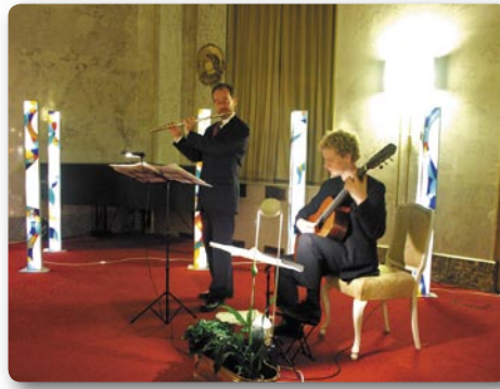
Alte Rathaus, Vienna 2005