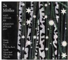
2X MÖLLER NOSAG 026