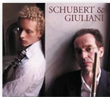
SCHUBERT & GIULIANI SFZ 1009