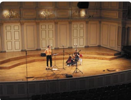
CD recording, Stockholm 2003