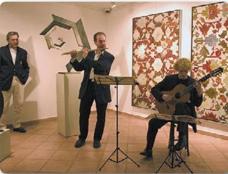
The Terraki Vakfi Gallery, Istanbul 2005