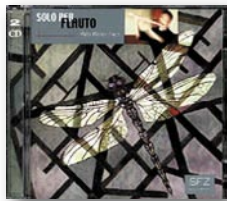
SOLO PER FLAUTO SFZ 2001