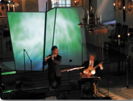
Music and video art, Österåker Church, Sweden, 2004