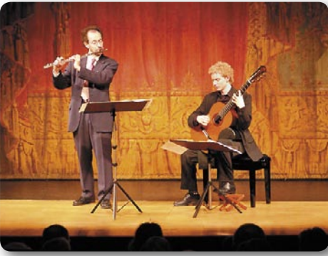
Varberg theatre 2007