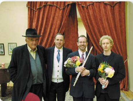
Korçë, Albania 2005