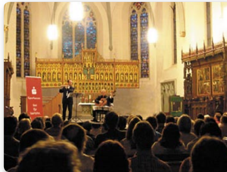
Iserlohn Guitar Symposium, Germany 2006