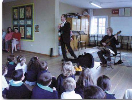
Children's concert, Istanbul 2005