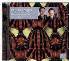
DUO 2XM SFZ 1007