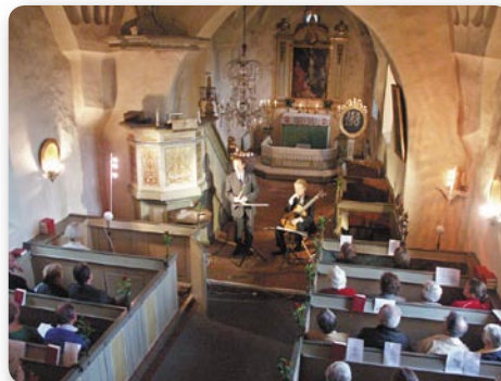
Kattnäs Church, Sweden, 2004